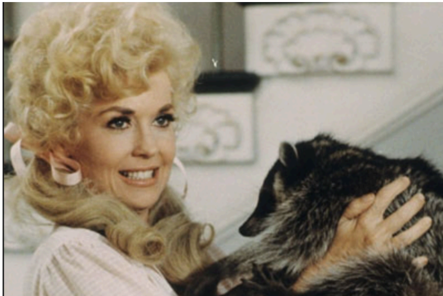
Donna Douglas/Elly May Clampett/Beverly Hillbillies